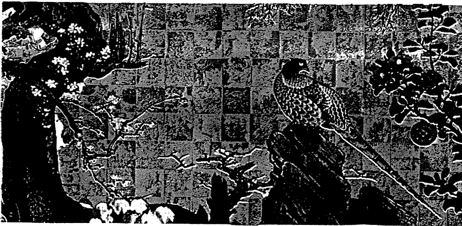
Plum Blossoms and Birds