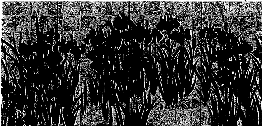
Irises National Treasure 17C. By Korin Ogata.